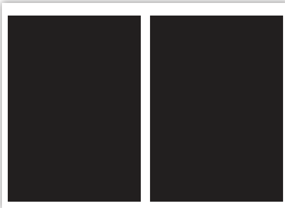
Double Page Spread