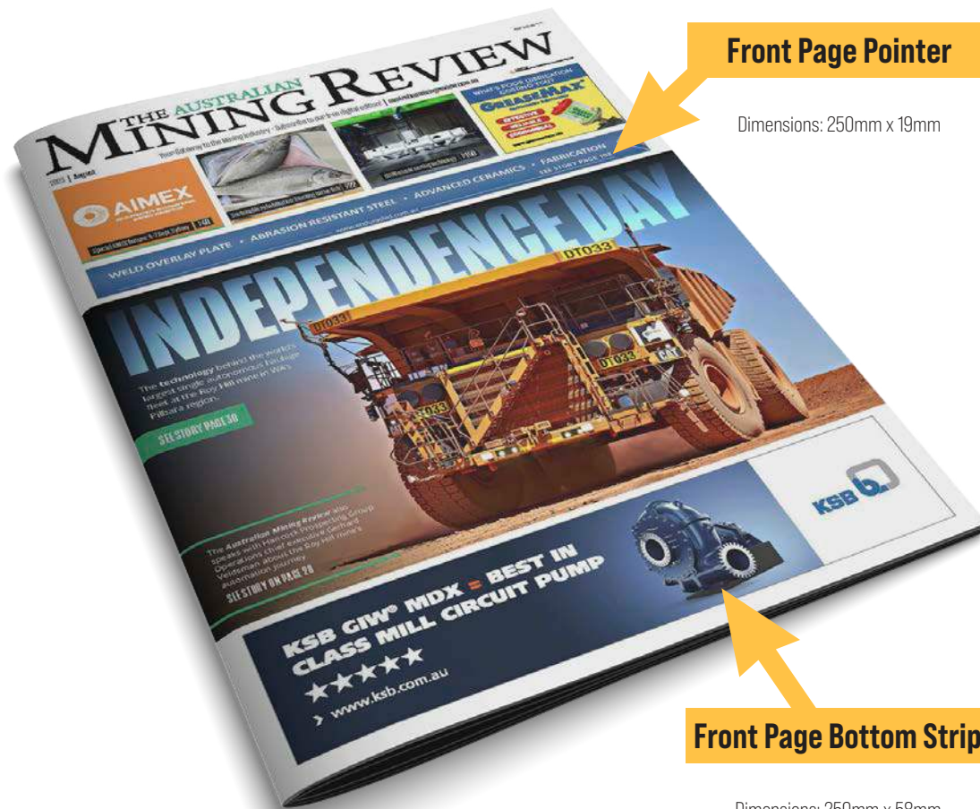
Front Page Pointer